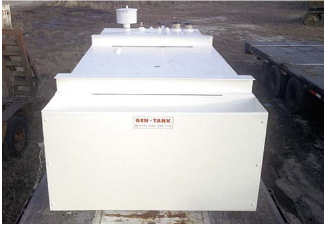
Low profile design enables structural support for the generator mounting

GEN-TANK Generator Base Tank provides sturdy support for your backup or emergency power generator. The low profile of the GEN-TANK design serves as the structural support for the generator mounting, while providing storage for a complete supply of generator diesel fuel.