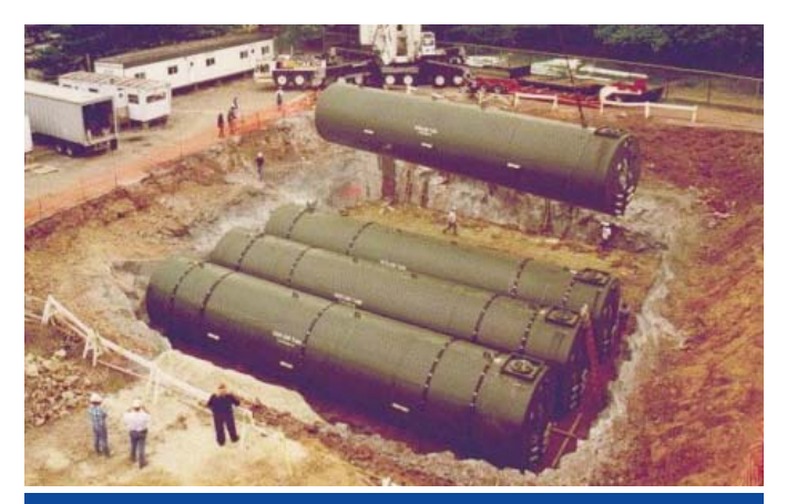
Compatible with a wide range of fuels and chemicals, including biodiesel and ethanol

PROTECT THE ENVIRONMENT. BUY RECYCLABLE STEEL TANKS.