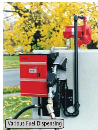
Various Fuel Dispensing