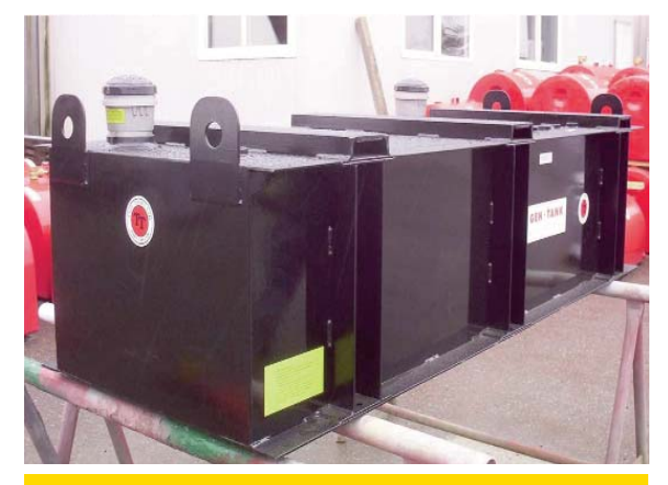
Compatible with a wide range of fuels and chemicals, including conventional diesel and biodiesel