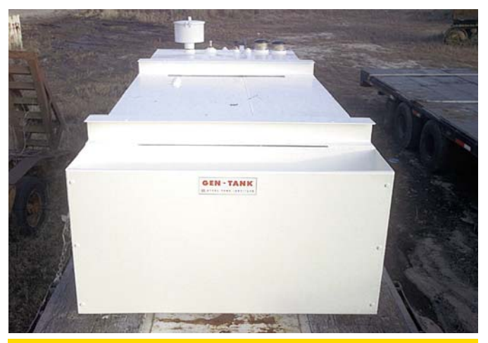
Low profile design enables structural support for the generator mounting

GEN-TANK Generator Base Tank provides sturdy support for your backup or emergency power generator. The low profile of the GEN-TANK design serves as the structural support for the generator mounting, while providing storage for a complete supply of generator diesel fuel.